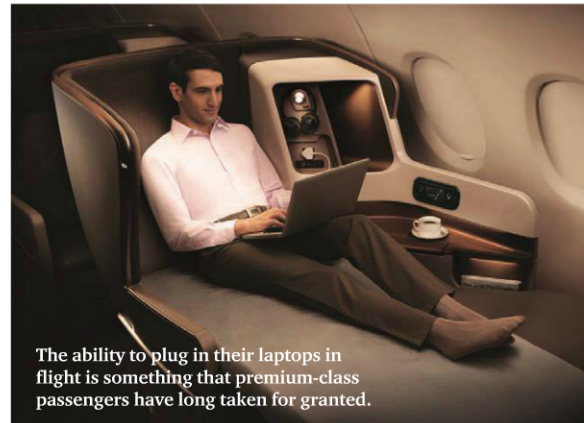
The ability to plug in their laptops in flight is something that premium-class passengers have long taken for granted.

or KID-Systeme does, but for an airline looking for a solution to their PSS problem, the +P is “simply a tag-along at a very minor incremental cost, because all of the infrastructure for the PSS is sufficient for USB power as well”.