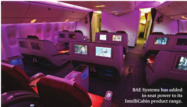
BAE Systems has added in-seat power to its IntelliCabin product range.