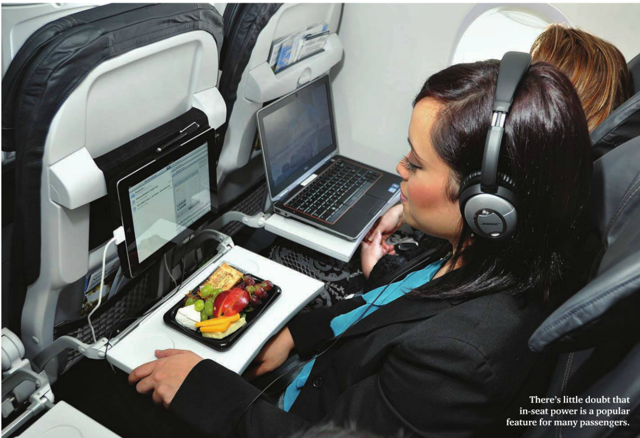
There's little doubt that in-seat power is a popular feature for many passengers.

Time will tell whether passengers are willing to pay to plug in, and whether other airlines will follow suit, but charging devices on board definitely has staying power. ■